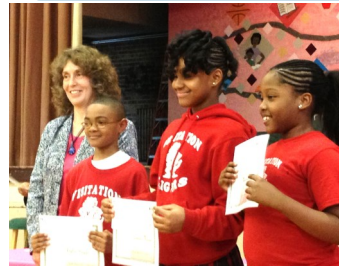
1st Scholarships 2014

Please join us as we continue into the future by making a donation, volunteering with Jim's Bridge or contributing to our clothing drives.