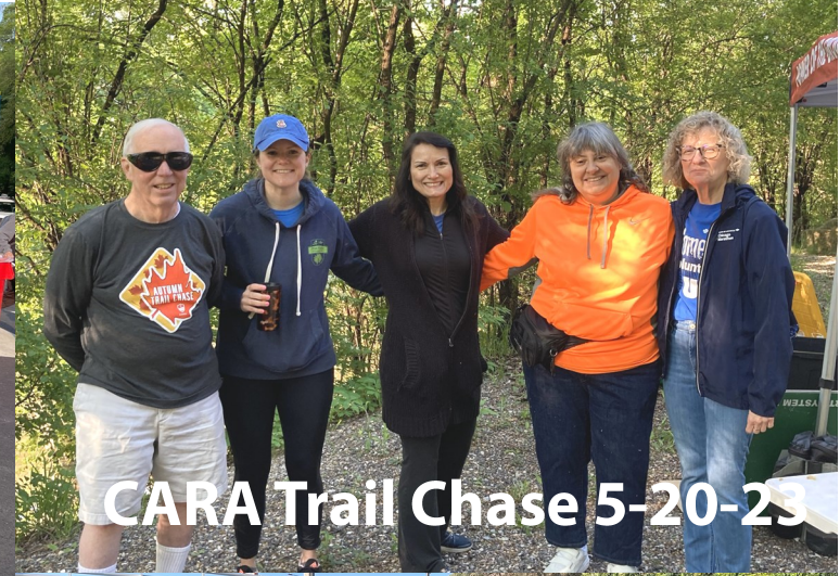
CARA Trail Chase 5-20-23