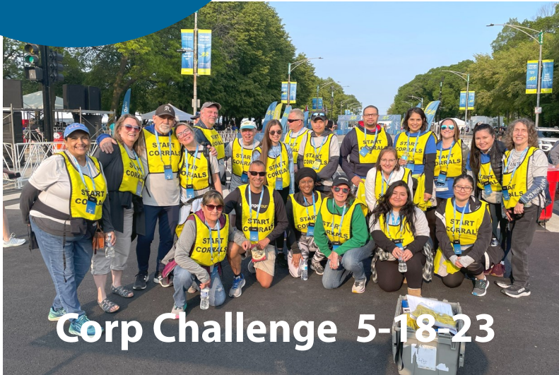
Corp Challenge 5-18-23

Volunteering at races is a fun and rewarding way to help raise funds for Jim's Bridge! The race organizers make a donation to Jim's Bridge based on the number of volunteers we recruit for the event. Here are some of the races where Jim's Bridge volunteered in 2023