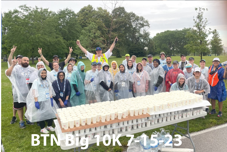
BTN Big 10K 7-15-23