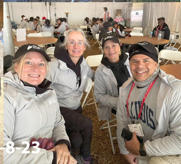
Chicago Marathon 10-8-23