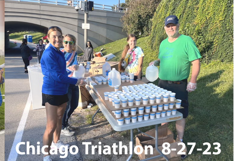
Chicago Triathlon 8-27-23