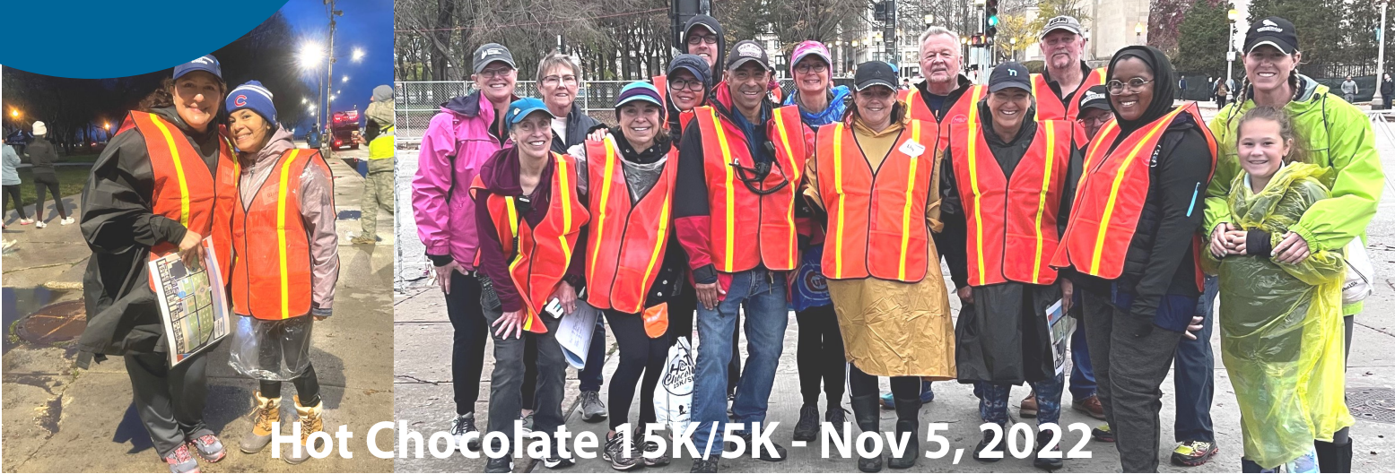
Hot Chocolate 15K/5K - Nov 5, 2022

Volunteering at races is a fun and rewarding way to help raise funds for Jim's Bridge. The race organizers make a donation to Jim's Bridge based on the number of volunteers we recruit for the event. Here are recent races and our planned 2023 event calendar.