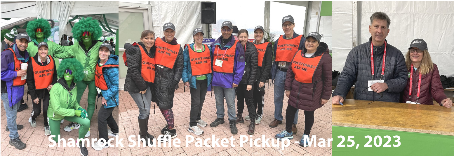
Shamrock Shuffle Packet Pickup - Mar 25, 2023