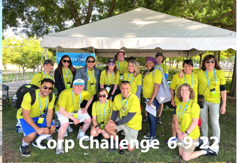
Corp Challenge 6-9-22