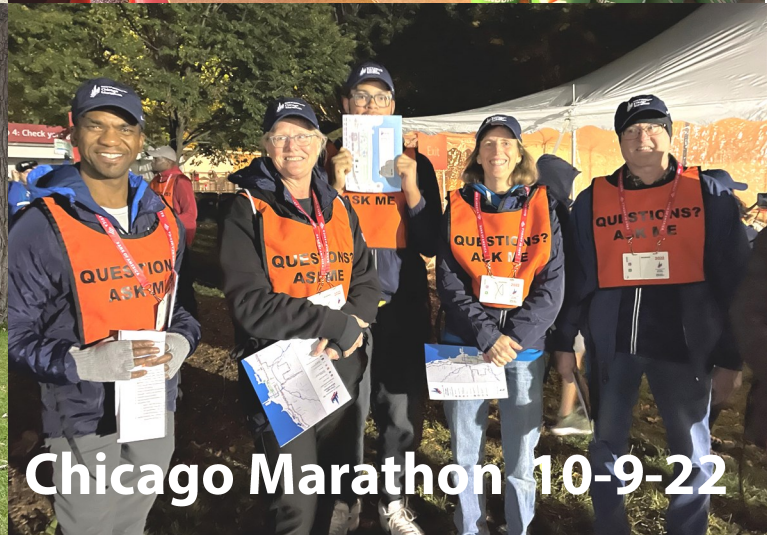
Chicago Marathon 10-9-22