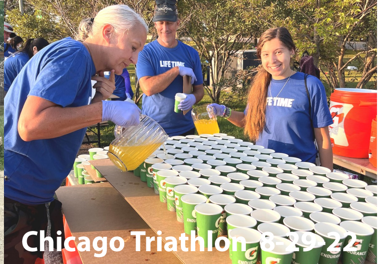
Chicago Triathlon 8-29-22