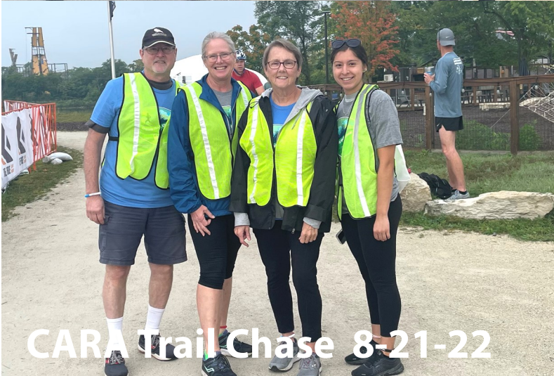
CARA Trail Chase 8-21-22