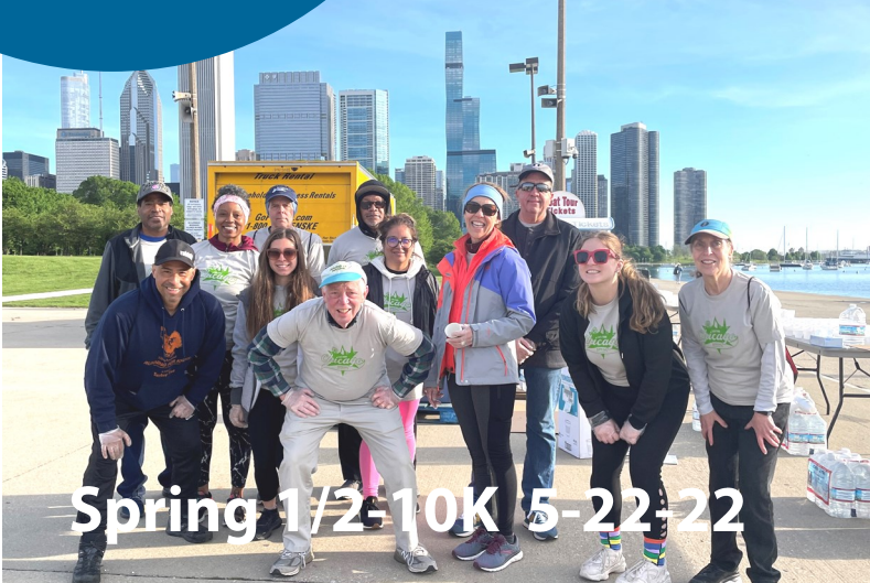
Spring 1/2-10K 5-22-22

Volunteering at races is a fun and rewarding way to help raise funds for Jim's Bridge! The race organizers make a donation to Jim's Bridge based on the number of volunteers we recruit for the event. Here are some of the races where Jim's Bridge volunteered in 2022.