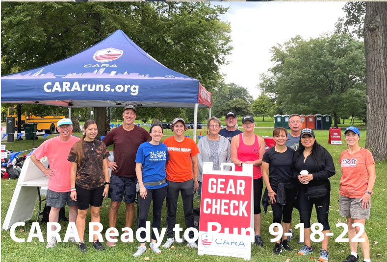
CARA Ready to Run 9-18-22