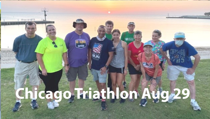
Chicago Triathlon Aug 29