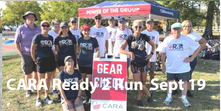
CARA Ready 2 Run Sept 19