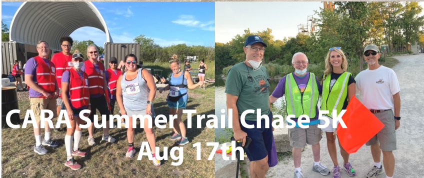
CARA Summer Trail Chase 5K Aug 17th