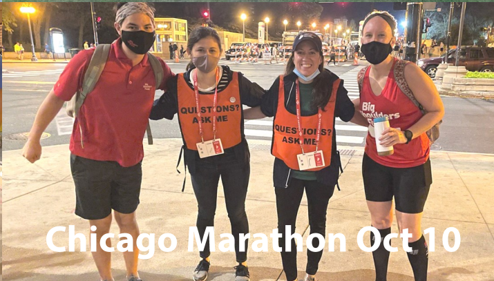
Chicago Marathon Oct 10