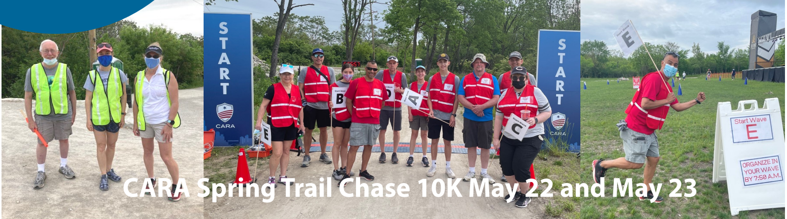
CARA Spring Trail Chase 10K May 22 and May 23

As in-person race events gradually return, Jim's Bridge has been able to recruit volunteers for several events, each with its own COVID precautions. Not only is it rewarding to volunteer, but it is also a fundraising activity for Jim's Bridge! The race organizers will make a donation to Jim's Bridge based on the number of volunteers we recruit for the event.