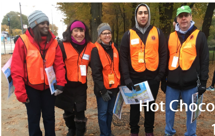
Hot Chocolate 15K/5K/Walk 11/2/19