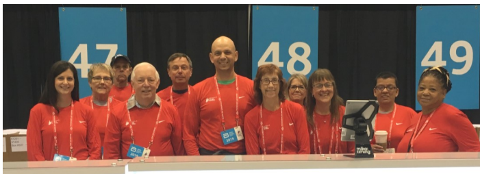
Chicago Marathon Expo 10/12/19

We completed our 2019 volunteer events with two popular races – The Chicago Marathon and the Hot Chocolate 15K/5K/Walk. The event organizers make a donation based on our number of volunteers. See more photos on our website and Facebook page.