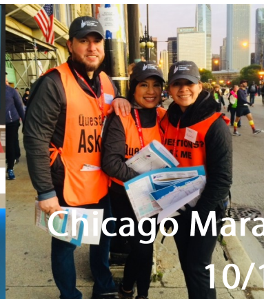
Chicago Marathon Race Day 10/12/19