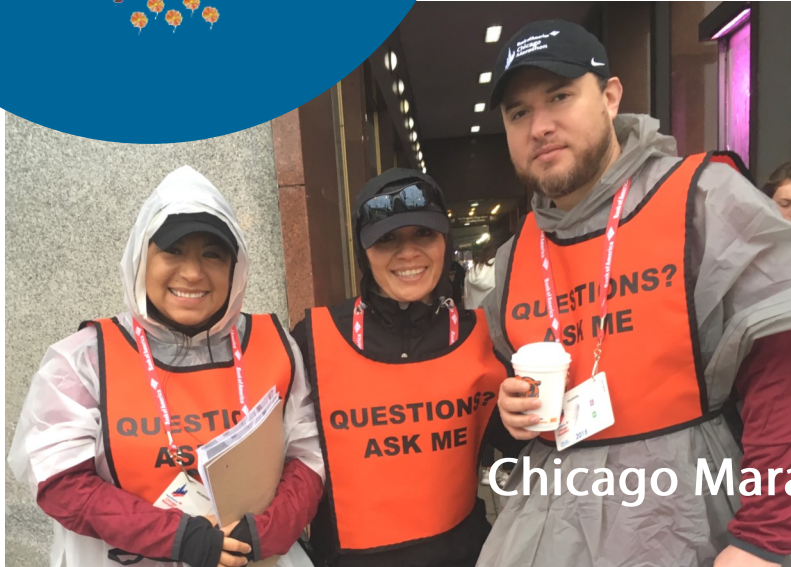
Chicago Marathon 10-7-18

We supported three races over the fall and spring! The event organizers make a donation based on our number of volunteers. See more photos on our website and Facebook page.