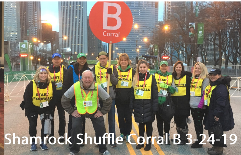
Shamrock Shuffle Corral B 3-24-19