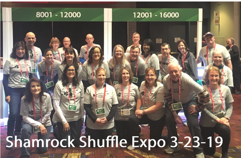
Shamrock Shuffle Expo 3-23-19