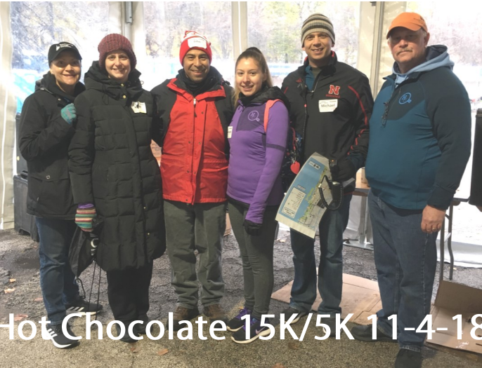
Hot Chocolate 15K/5K 11-4-18